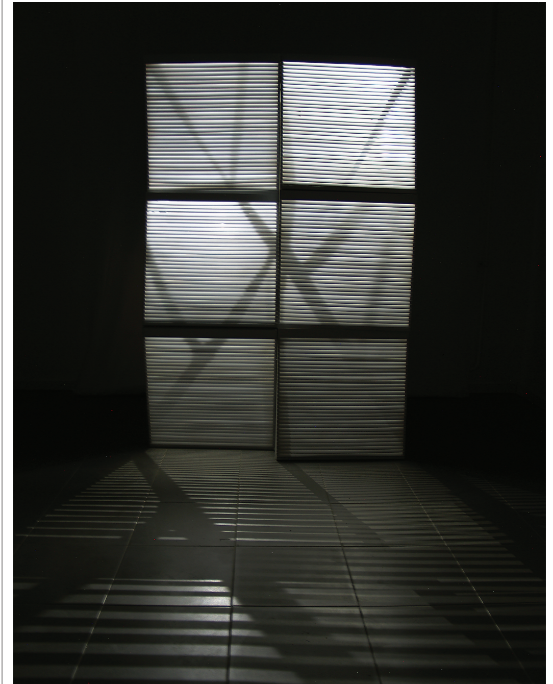
Breeze , 2011. medijapan, LED rasvjeta, ventilator 158 x 106 x 107 cm