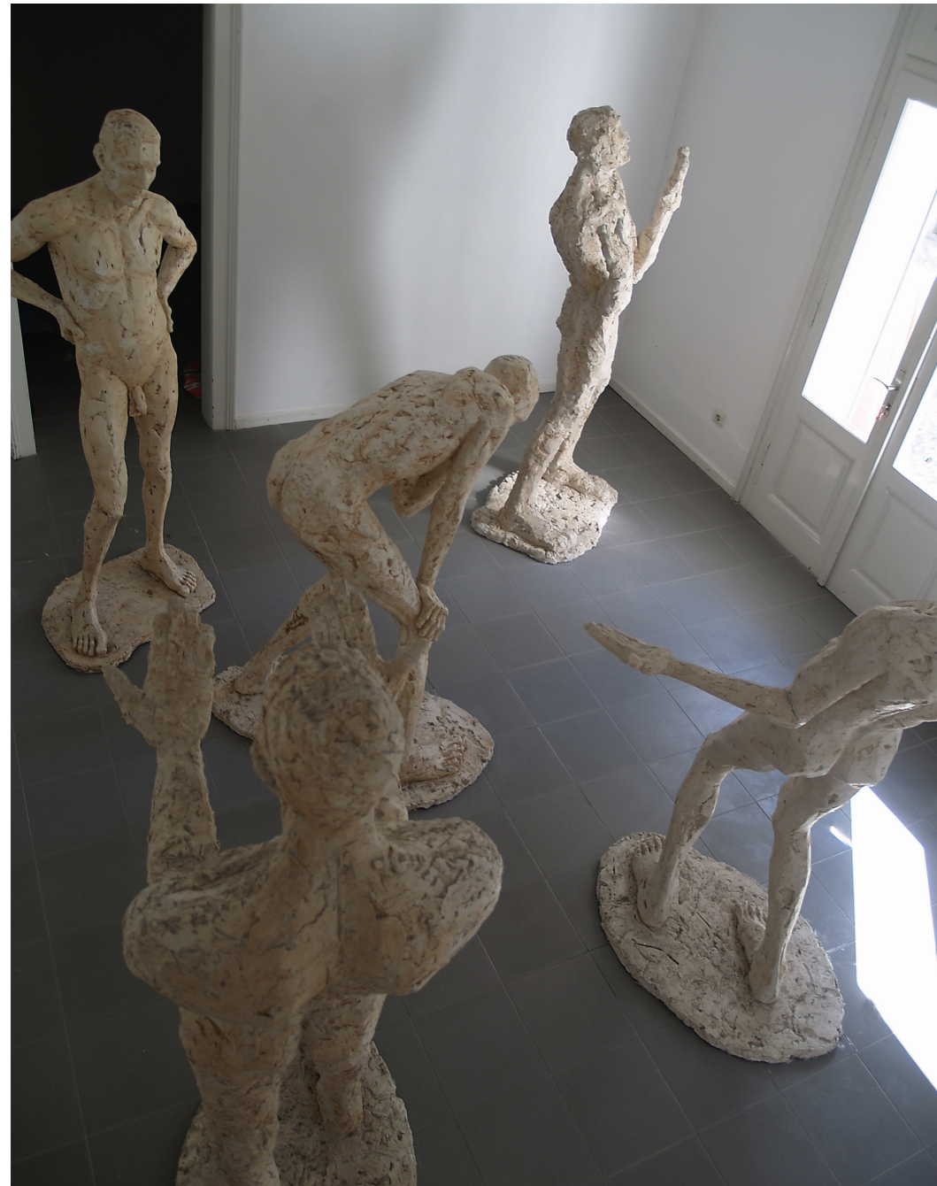
Oblici psihičke stvarnosti 2009. gips, pet figura, visina 200 cm